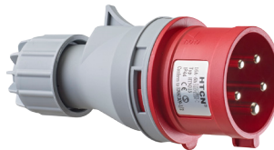
CEE plug with phase inverter 400V 16A 3P+O+J Art. no.: 3160307