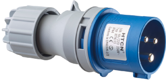
CEE plug 250V 16A 2P+O 3160301