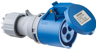
CEE extension unit, socket 250V 16A 2P+O Art. no.: 3160302