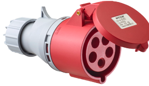
CEE extension unit 400V 32A 3P+O+J Art. no.: 3160306