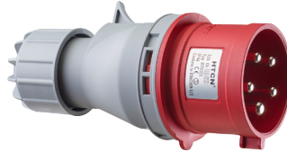
CEE plug 400V 32A 3P+O+J Art. no.: 3160305