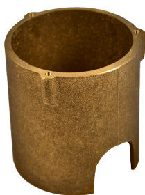
Tube for sensor

The tube is a conduit for TM-3356 and cover of the tube to cover hole during installation. The cover is placed in the tube before for example, asphalt comes on - house/cover must be ordered separately.